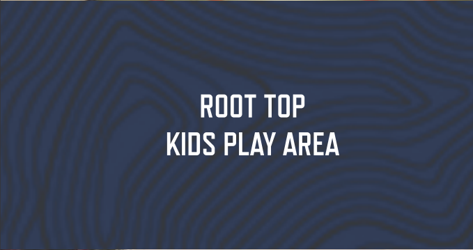
ROOT TOP KIDS PLAY AREA